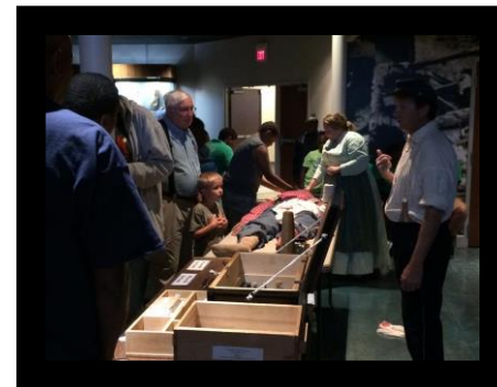
Civil War Medicine and Hygiene Demonstration

We have 3 options available for school groups (All groups will watch our ten-minute film first)